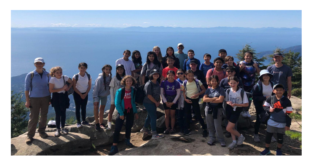
Grade 7 Hike to Eagle Bluffs