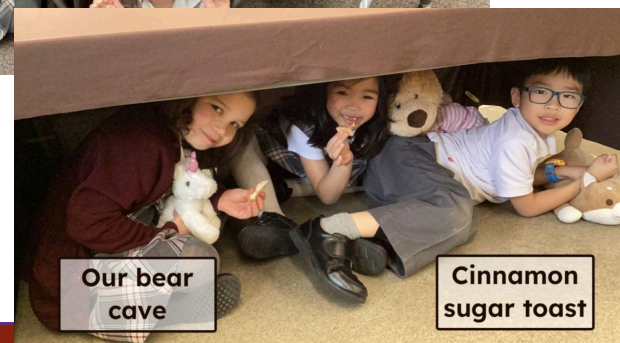
Our bear cave