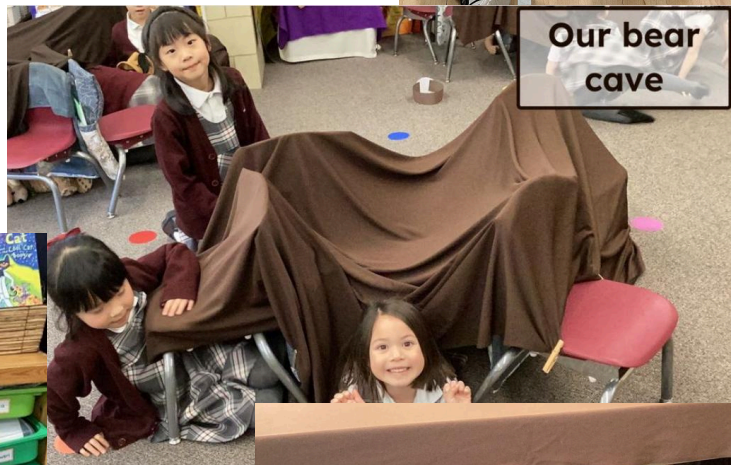
Our bear cave